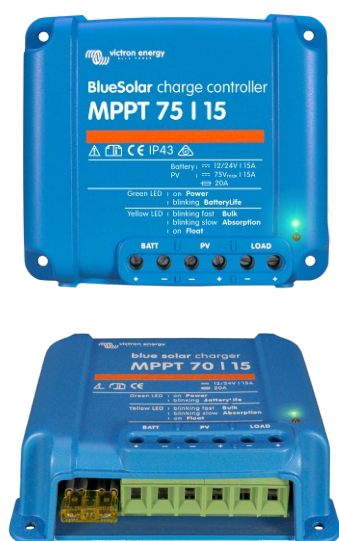
Solar Charge Controller MPPT 75/15