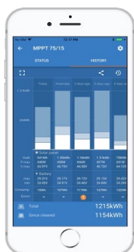
VE.Direct Bluetooth Smart dongle needed to enable Bluetooth