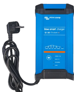
Blue Smart IP22 12/30 (3)