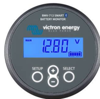
BMV-712 Smart Battery Monitor