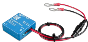
Smart Battery Sense Enables temperature and voltage compensated charging.